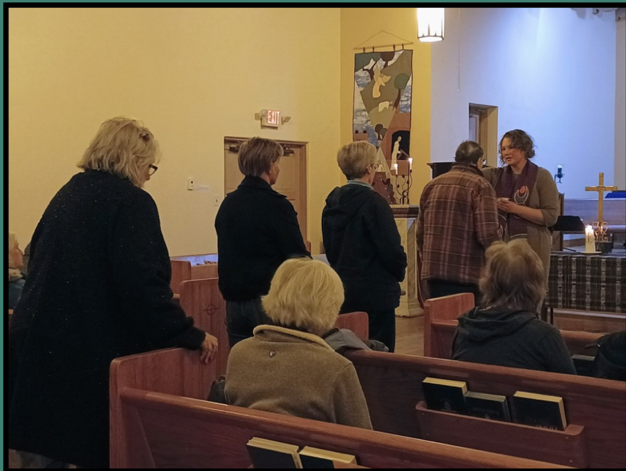
Imposition of ashes on Ash Wednesday