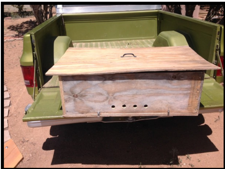
A worm box, ready to be delivered and welcome its new inhabitants!