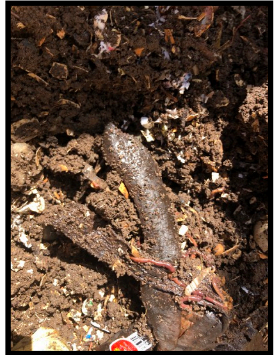
One of Jim's worm boxes; the red worms can be seen in the bottom third of the photo