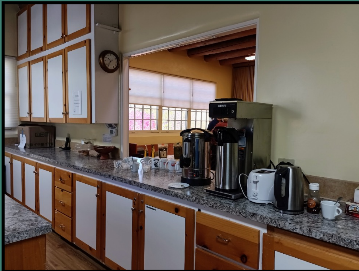
Our new counters, in use on a Sunday morning coffee hour!