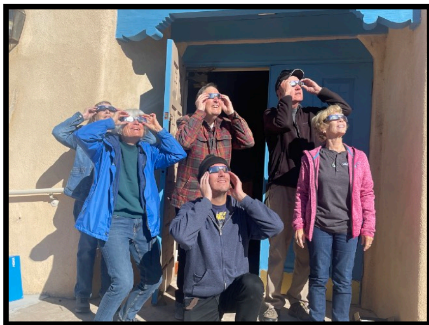
Watching the eclipse!