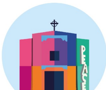
WESTMINSTER PRESBYTERIAN CHURCH (USA) SANTA FE