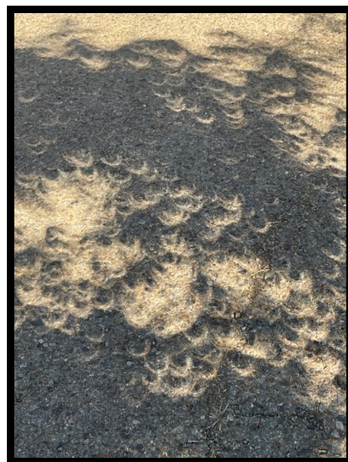
The eclipse through leaves in our parking lot.