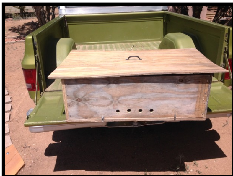
A worm box, ready to be delivered and welcome its new inhabitants!