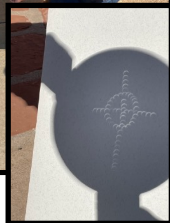
A closeup of the pinhole projection shown above