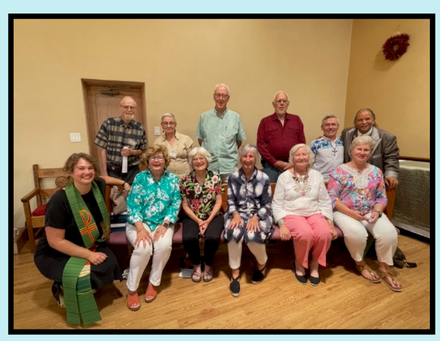
Gospel music worship leaders - thanks to all who helped lead!